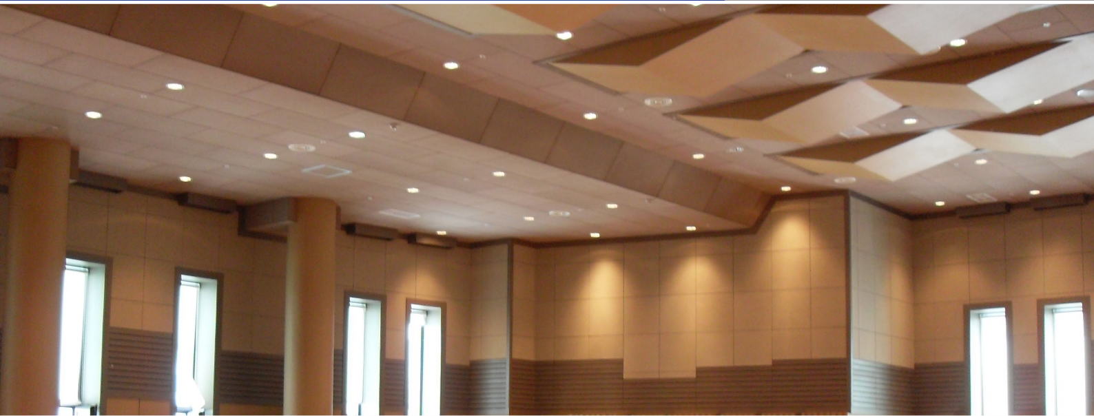
Quietstone Light panels used on ceiling and walls.